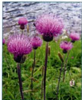
Heather photographed these flowers during her trip to Switzerland.

SewStylish: When did you first start sewing?